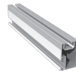
Art. 0109 Mounting Rail length: 2200mm sztuk: 2