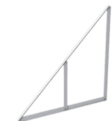
Art. TK-003 Triangle sztuk: 2