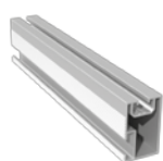
Art. 0109 Mounting Rail Measurements: 31x50 Length: 6200mm, 3100mm, 2070mm Joining screws top: M8 side: M8/M10/M12 Material: AL 6060T6