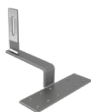
Art. 0114 Pantile Roof Hook vertical Plate: 180x50x4, (12x)Hole: Ø7mm Bar: 30x5, Long Hole: 9x37,5 Use: pantile roof, horizontal mounting of PV modules Material: A2 1.4301 stainless steel, shot blasting